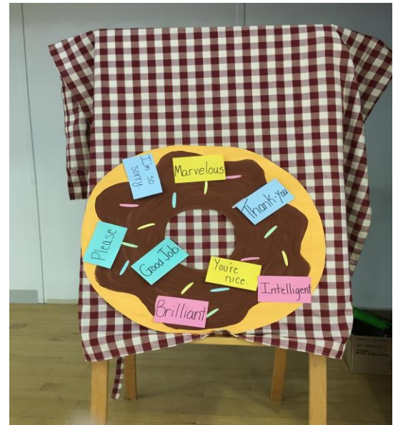
Our 2 nd graders sprinkled a little kindness during our SMART assembly.

The Winthrop Public Schools does not discriminate on the basis of race, color, religion, sexual orientation, national origin, age, gender, disability, or homelessness for employment, participation in, admission/access to, or operation and administration of any educational program or activity in the School District.