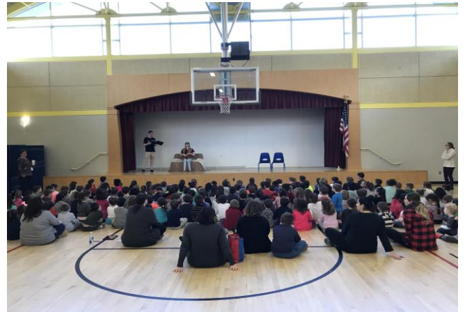
Our students enjoying WHS Drama students performance of 3 Frog and Toad short stories that focused on SMART Plan elements.