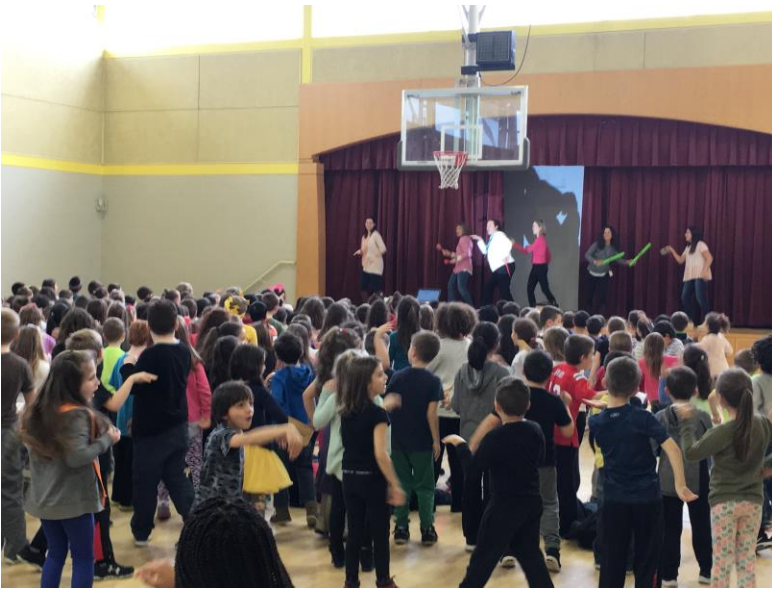
Our new SMART dance, SMART SEE KO, SMART SMART SEE KO!